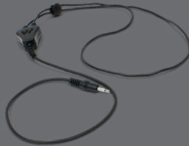
Neckloops NKL 001 / NKL 001 S