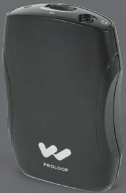
Loop Receiver PLR Bp1